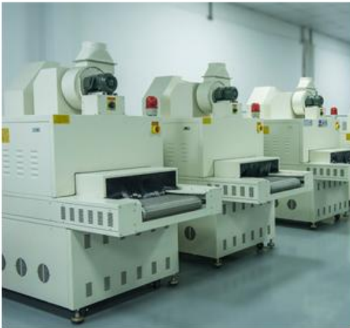
UV light machine