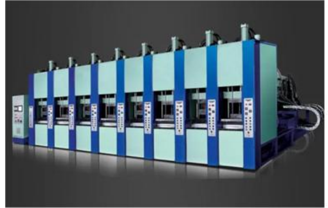
EVA injection machine