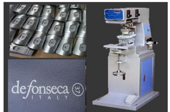
Pad Printing Machine