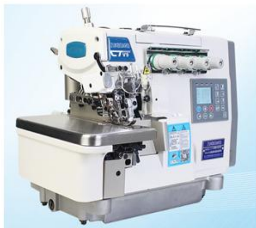
automatic welting machine